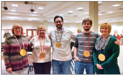
The winning team from the 2014 Trivia Night Fundraiser was from First Federal of Bucks County. HealthLink is looking for support from the community to bring more teams and more donations for the 2015 event.

Local businesses can support the event through various sponsorship opportunities, and groups of friends, family or coworkers can collect items to donate a